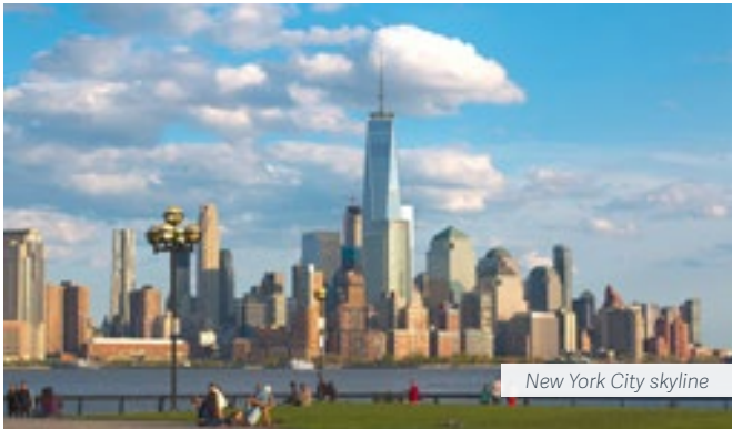
New York City skyline