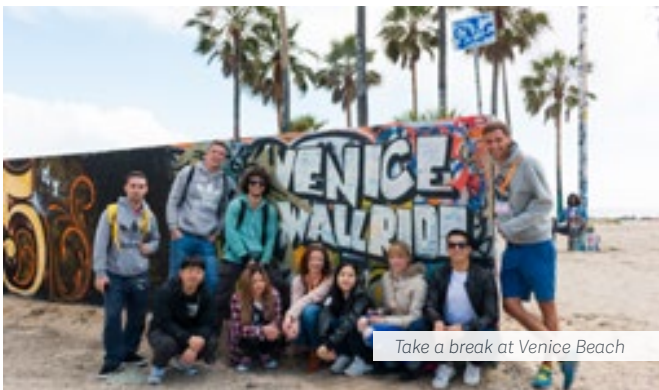
Take a break at Venice Beach